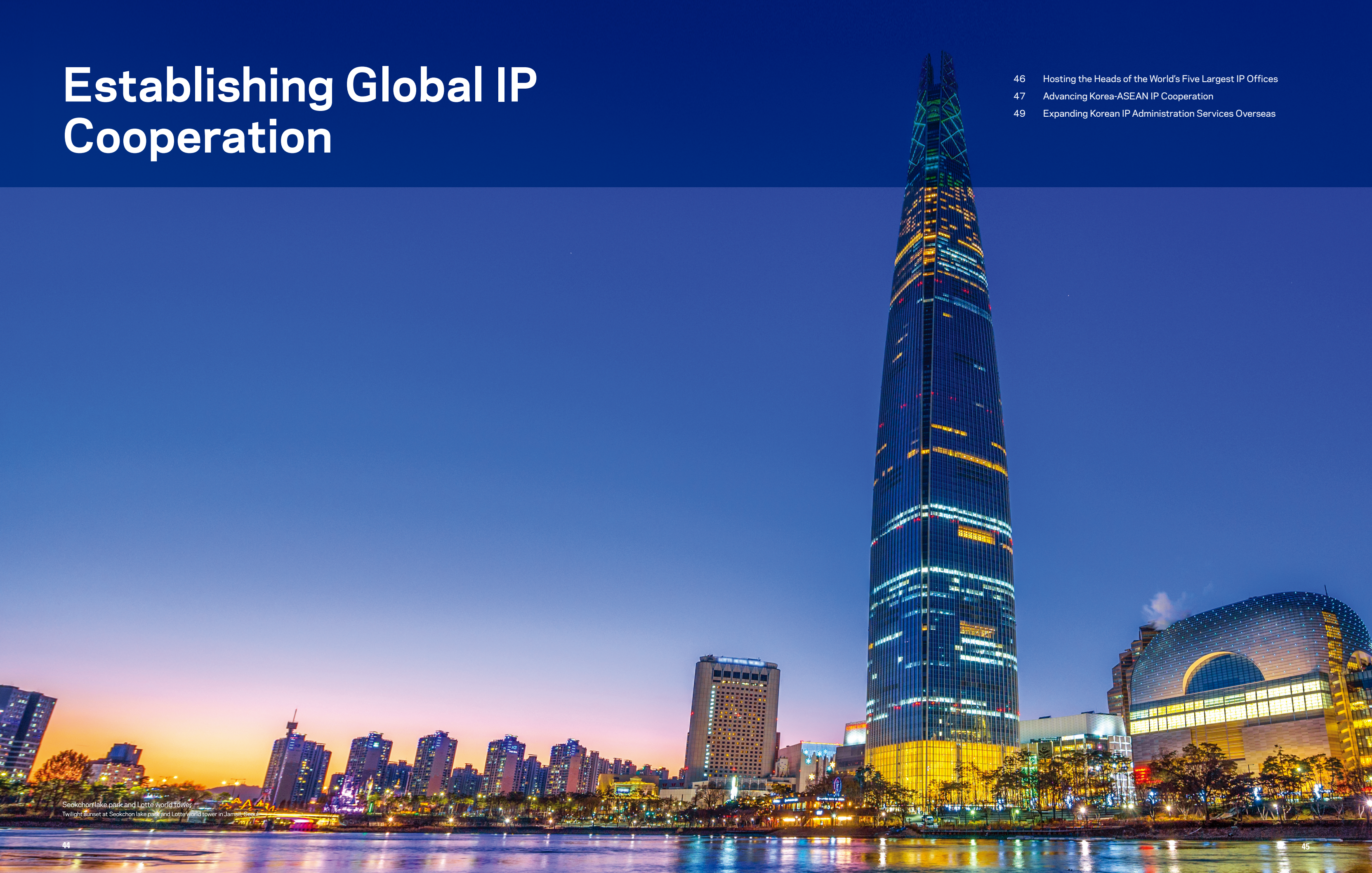
Seokchon lake park and Lotte world tower Twilight sunset at Seokchon lake park and Lotte world tower in Jamsil, Seoul